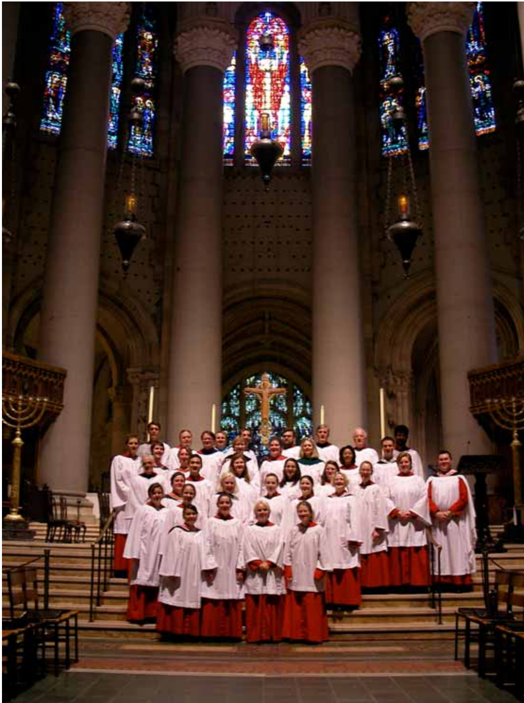
Photo of Christ Church Cambridge Evensong Choir taken from the High Altar at the Cathedral of St. John the Divine while on tour in New York City. A webcast of the Eucharist at St. Thomas Church is available at http://www.saintthomaschurch.org/Stream.html